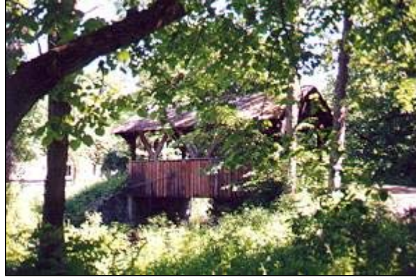
Photo of Waldbillig Bridge