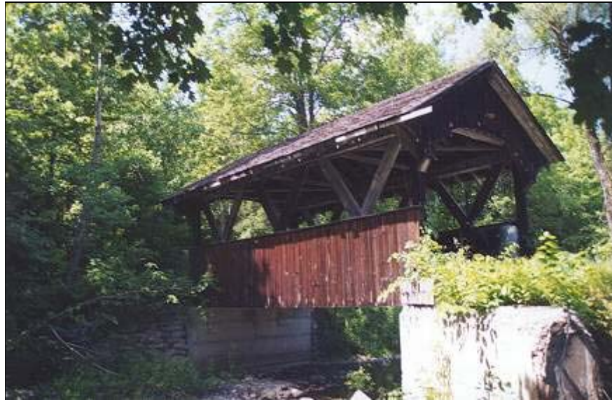
Photo of Waldbillig Bridge