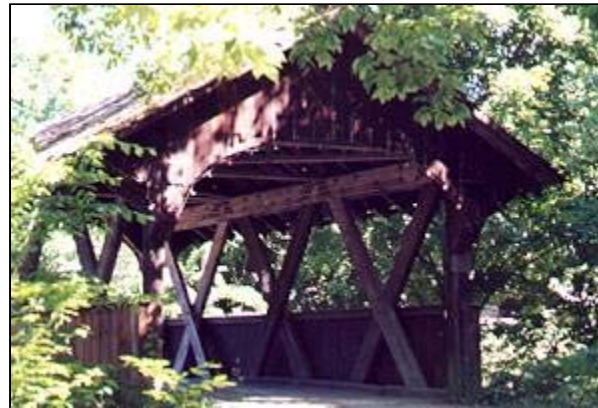
Waldbillig Bridge Portal