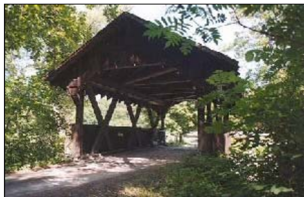
Waldbillig Bridge Portal