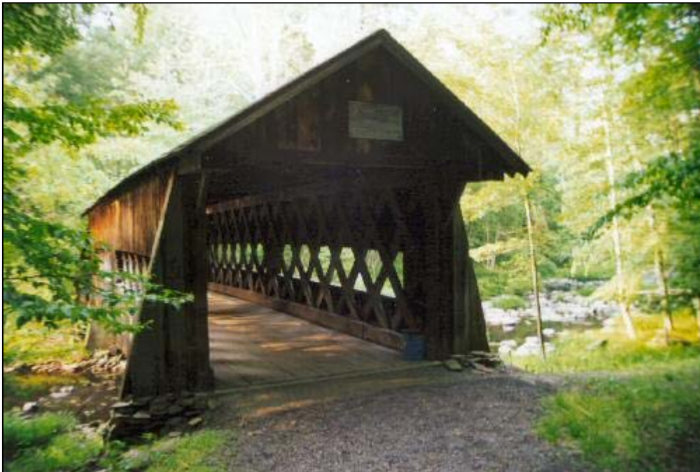
New Paltz Campus Bridge Portal