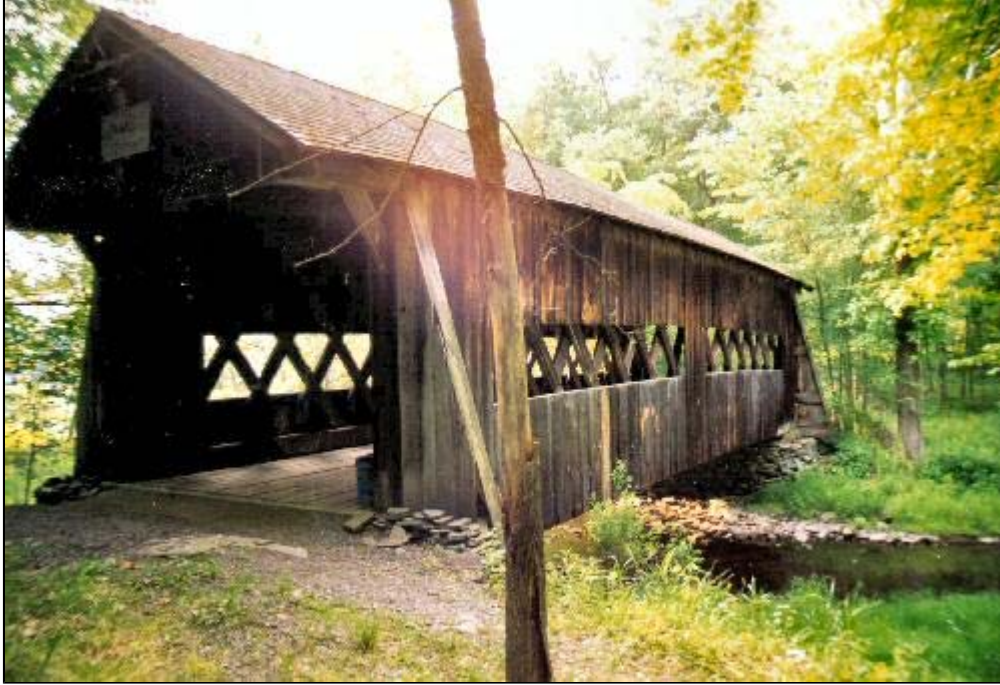
Photo of New Paltz Campus Bridge