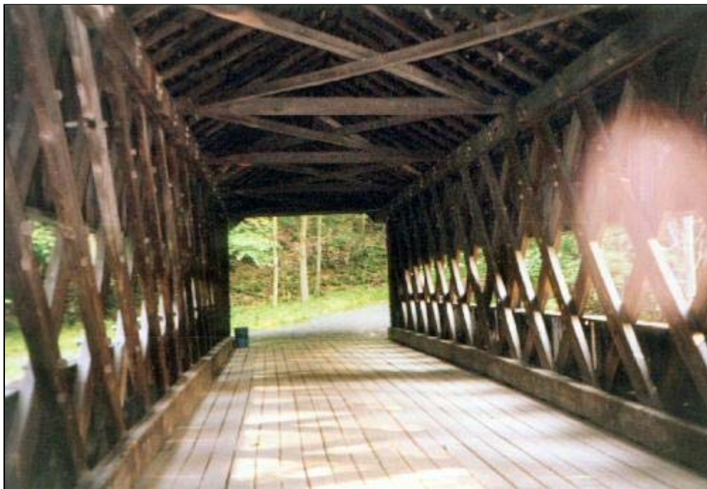
Town Lattice Truss