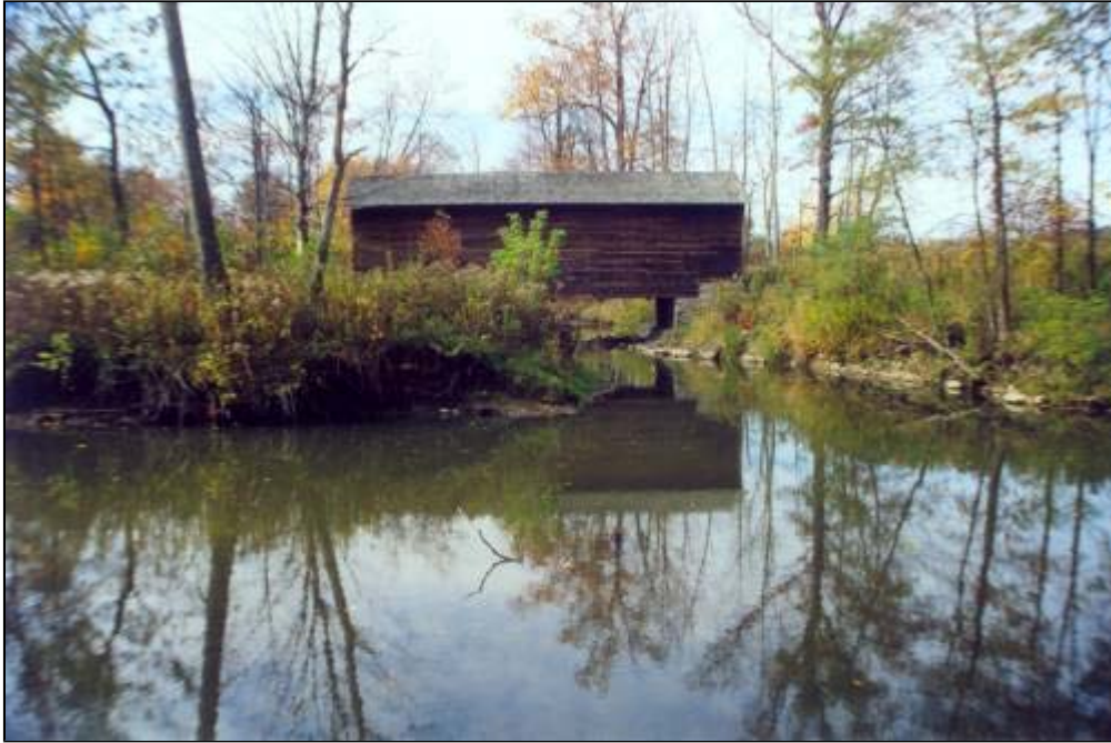
Photo of Hyde Hall Bridge