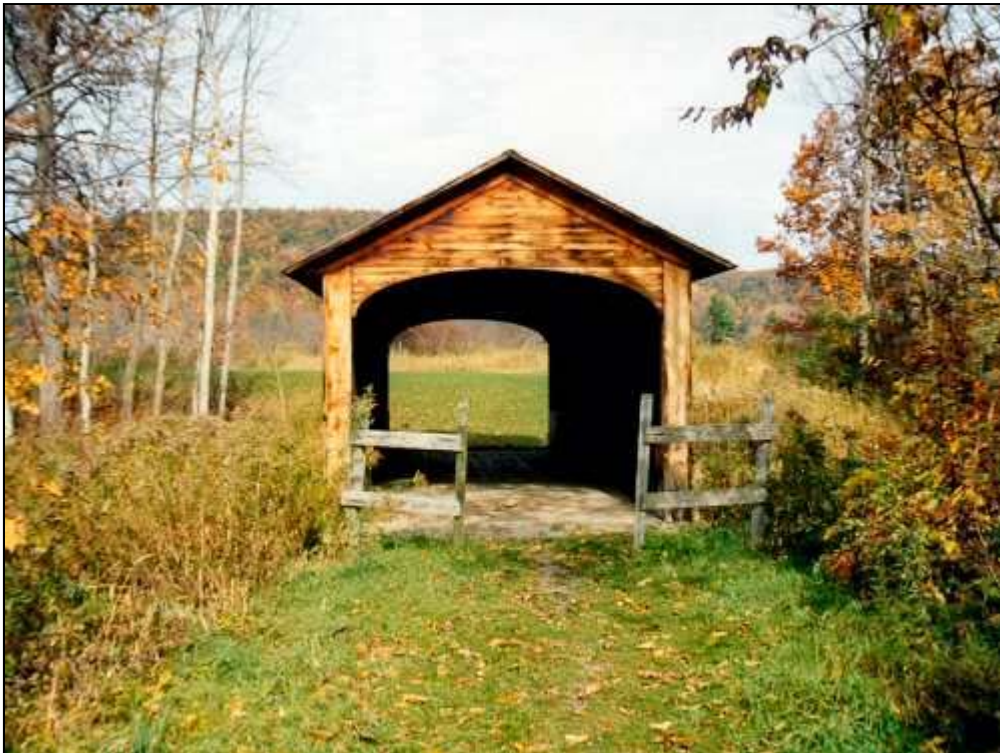
Hyde Hall Bridge Portal