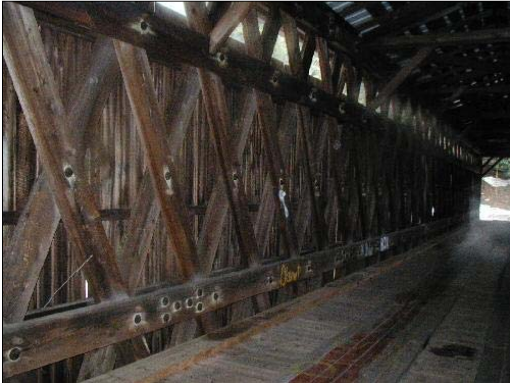
Town Lattice Truss