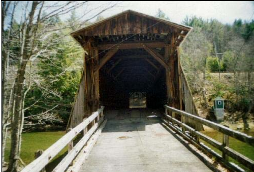
Halls Mills Bridge Portal