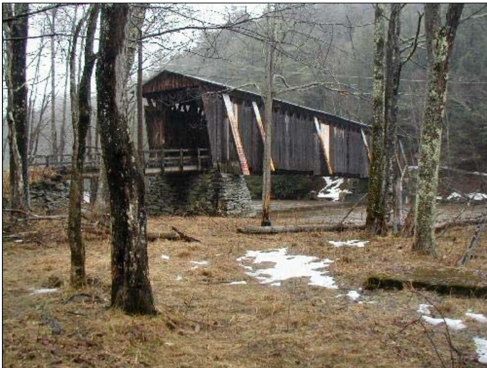
Halls Mills Bridge during flooding in April 2005