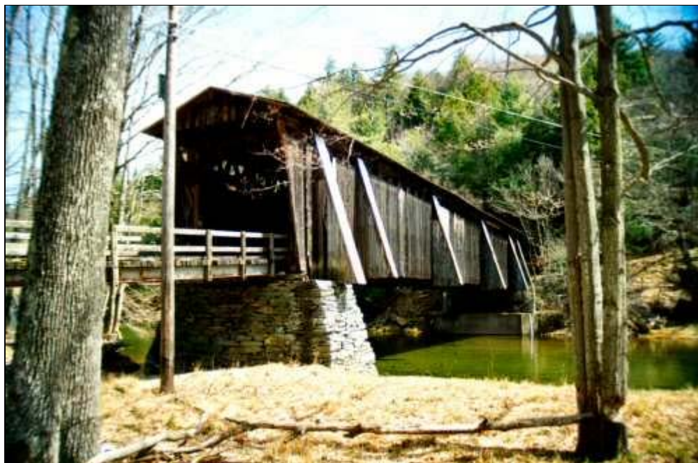
Photo of Halls Mills Bridge