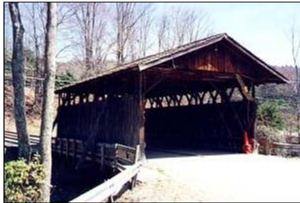
Photo of Grahamsville Bridge Portal