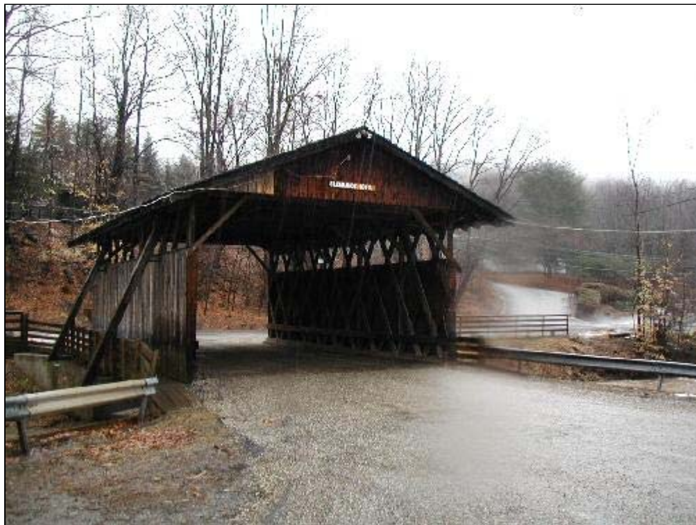
Photo of Grahamsville Bridge Portal during flooding in April 2005