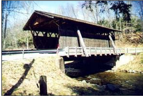
Photo of Grahamsville Bridge