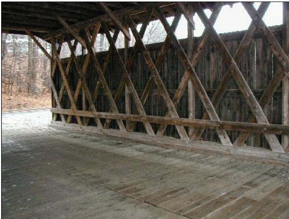
Photo of Grahamsville Bridge Truss