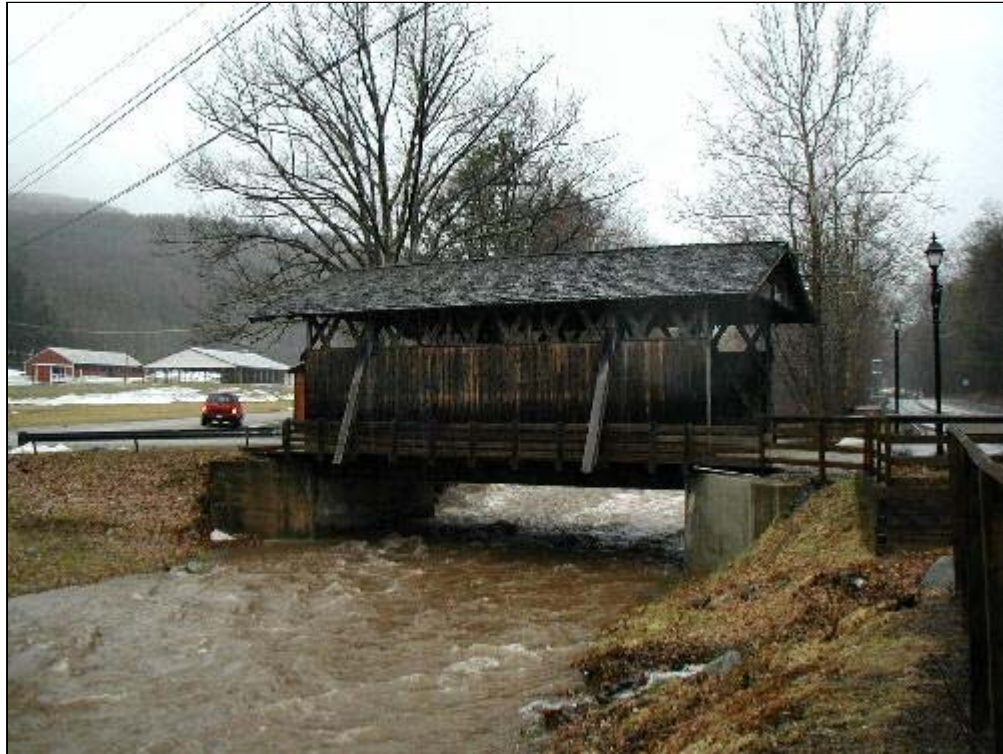
Photo of Grahamsville Bridge during flooding in April 2005