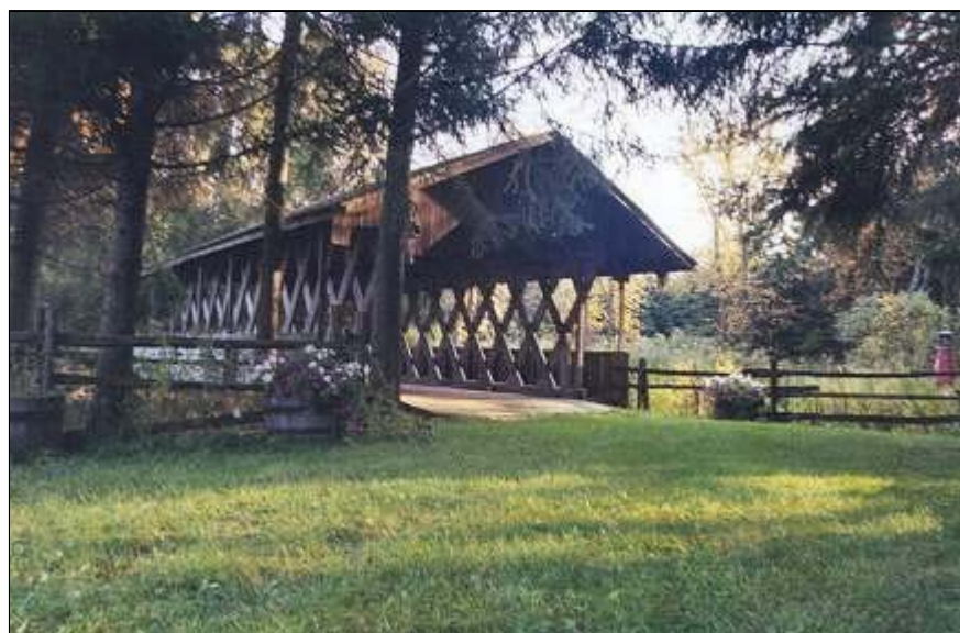
Frontenac Bridge Portal