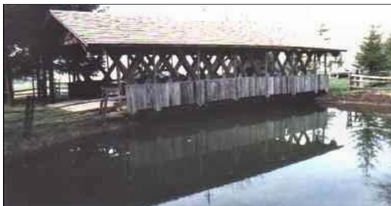
Photo of Frontenac Bridge