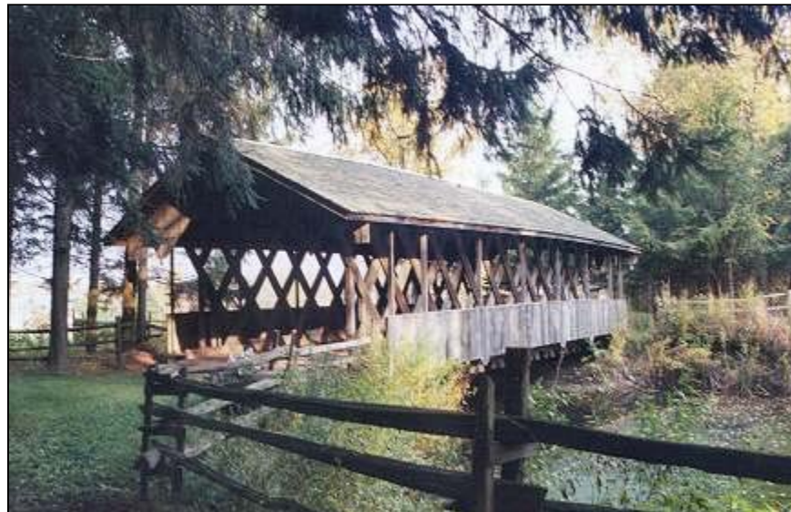
Photo of Frontenac Bridge