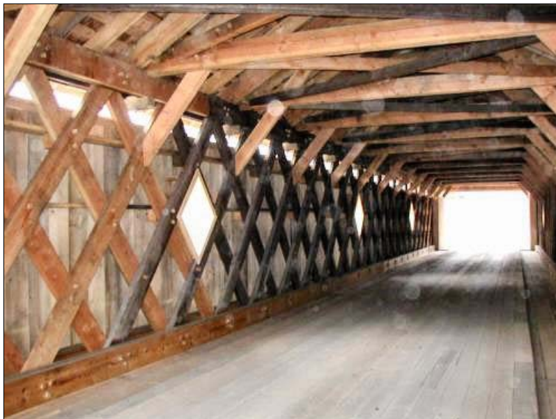
Town Lattice Truss