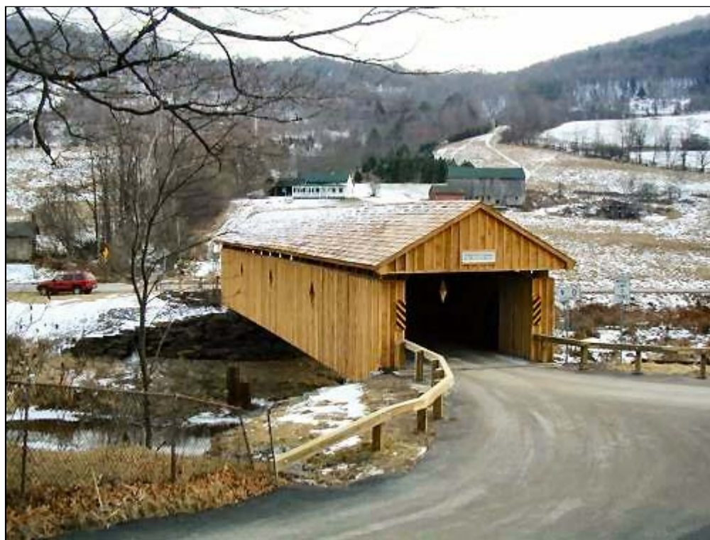
Fitches bridge on January 5, 2002