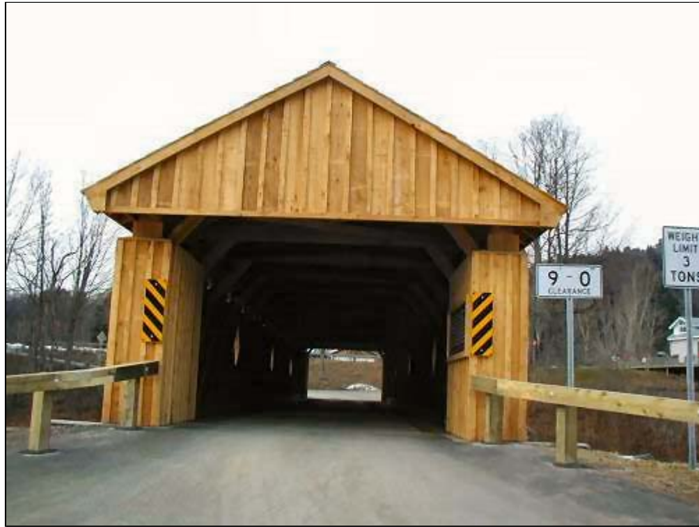
Fitches Bridge Portal - January 5, 2002