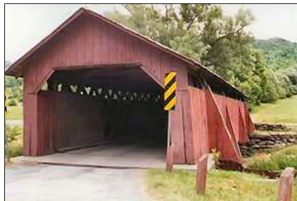
Fitches bridge before 2001