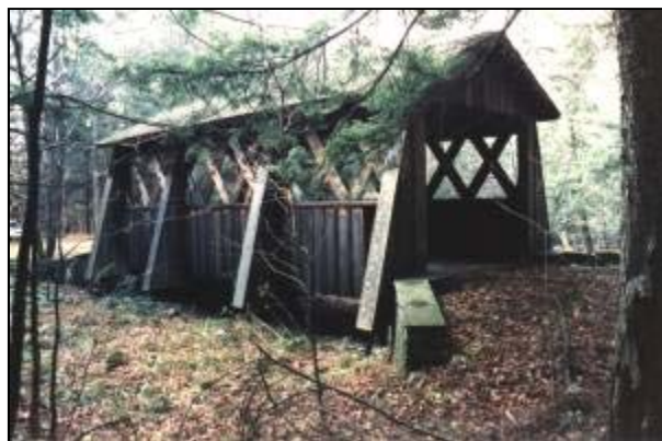
Erpf Bridge Photo by Dick Wilson - 11/90