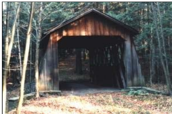
Erpf Portal Photo by Dick Wilson - 11/90