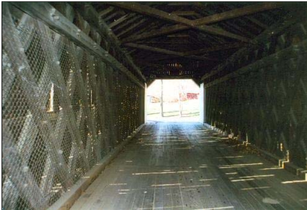
Eagleville Bridge Truss