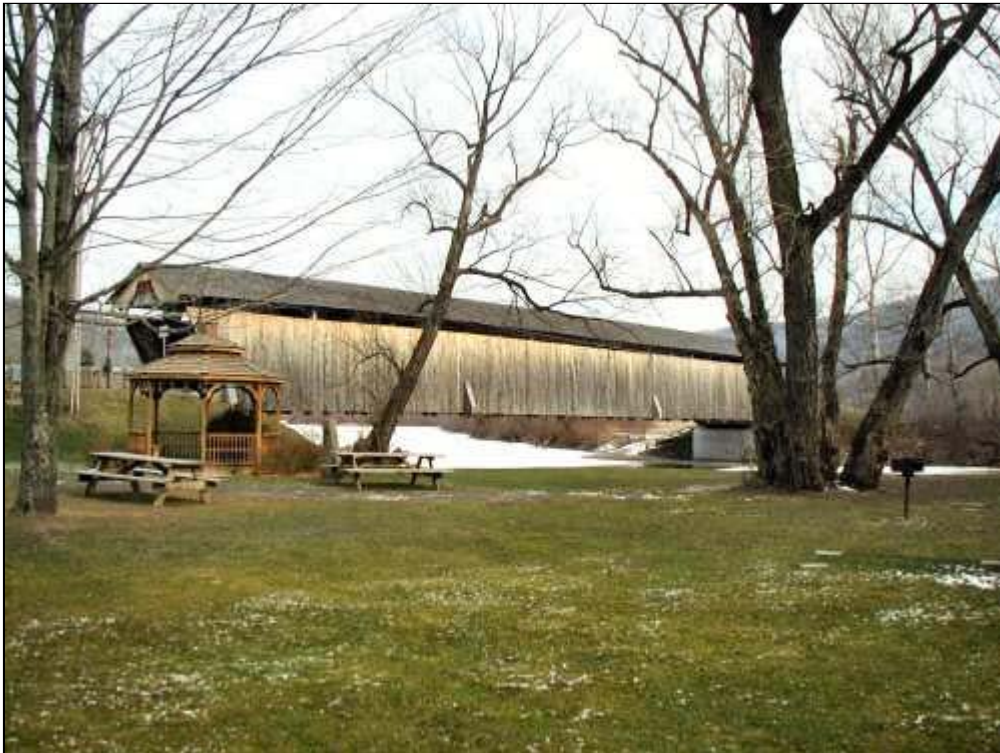
Downsville bridge in 1999