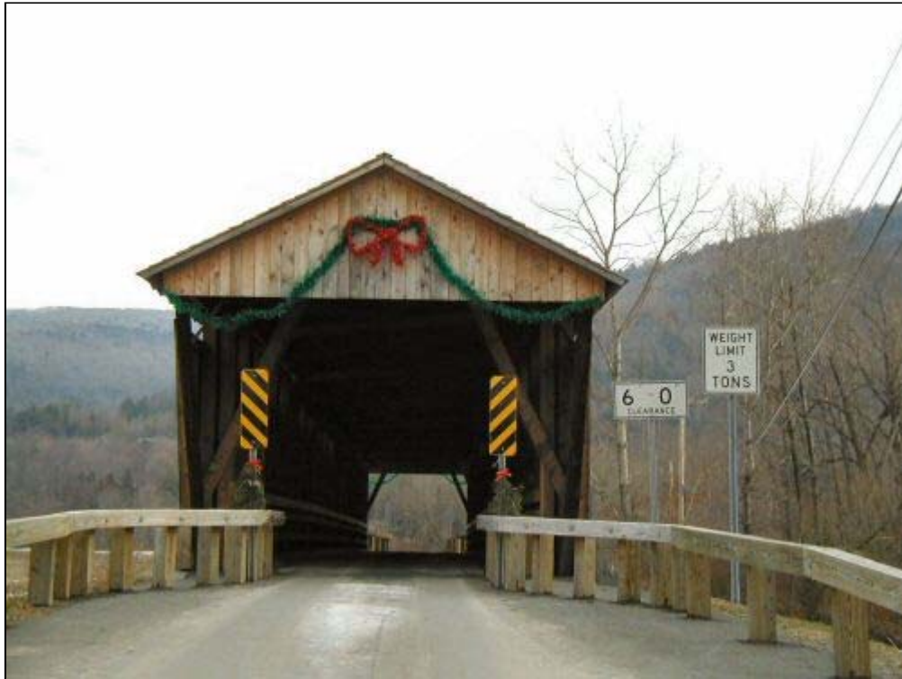
Downsville Bridge Portal - 1999