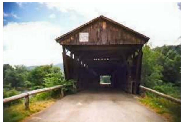
Downsville Bridge before 1999