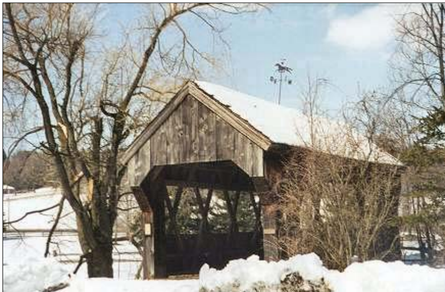
Americana Village Bridge in Winter