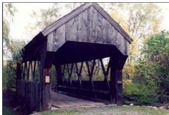
Americana Village Bridge Portal