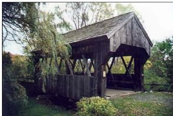
Photo of Americana Village Bridge